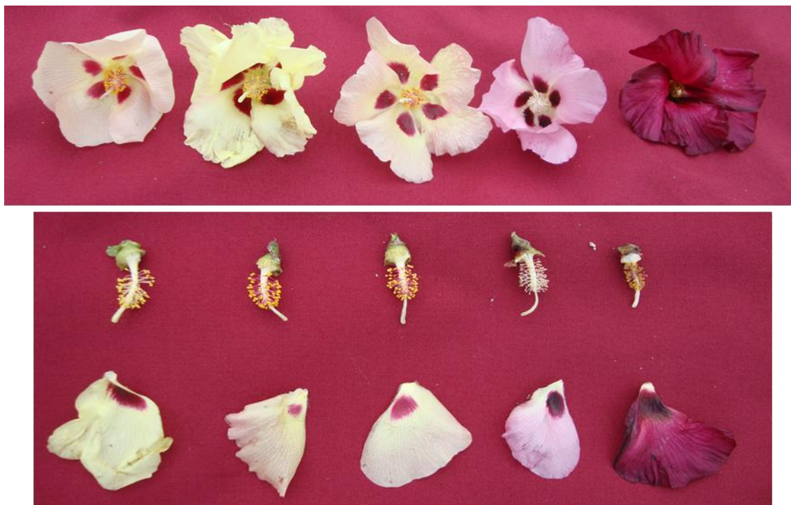
Figure 1. Genetic variation of the flower in between the cotton wild species

genotypes were showed fibre strength ranging from 24.3 g/tex (P56-2) to 29.4 g/tex (P56-4).